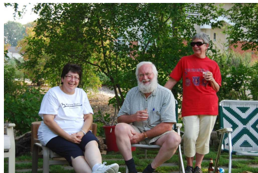
Happy, relaxed Humanists