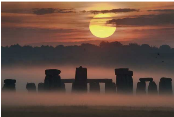
Summer solstice over Stonehenge

Not to mention, of course, the Summer Solstice, also on June 21 st !